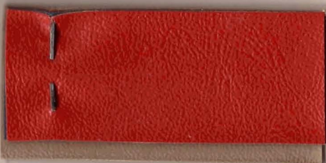
VERMILLION . BLUE . TAN (embodying beige)