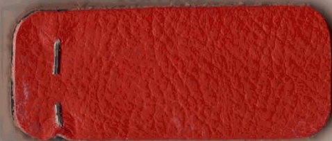
VERMILLION . BLUE . BLACK (with contrasting piping)