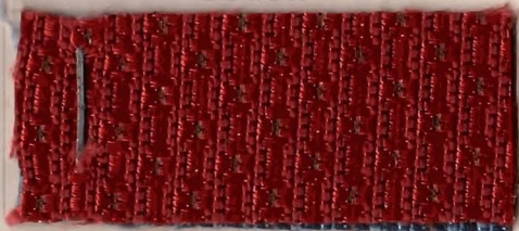
RED . BLUE

The models to which the colors and trims are applicable are shown on reverse of this color chart.